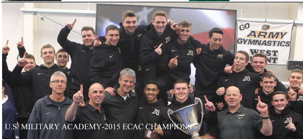
U.S. MILITARY ACADEMY-2015 ECAC CHAMPIONS