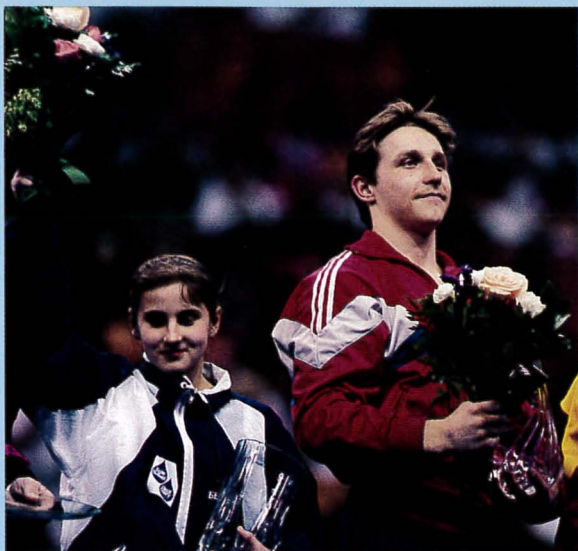
Sportsport Photographs © Eileen Langhly